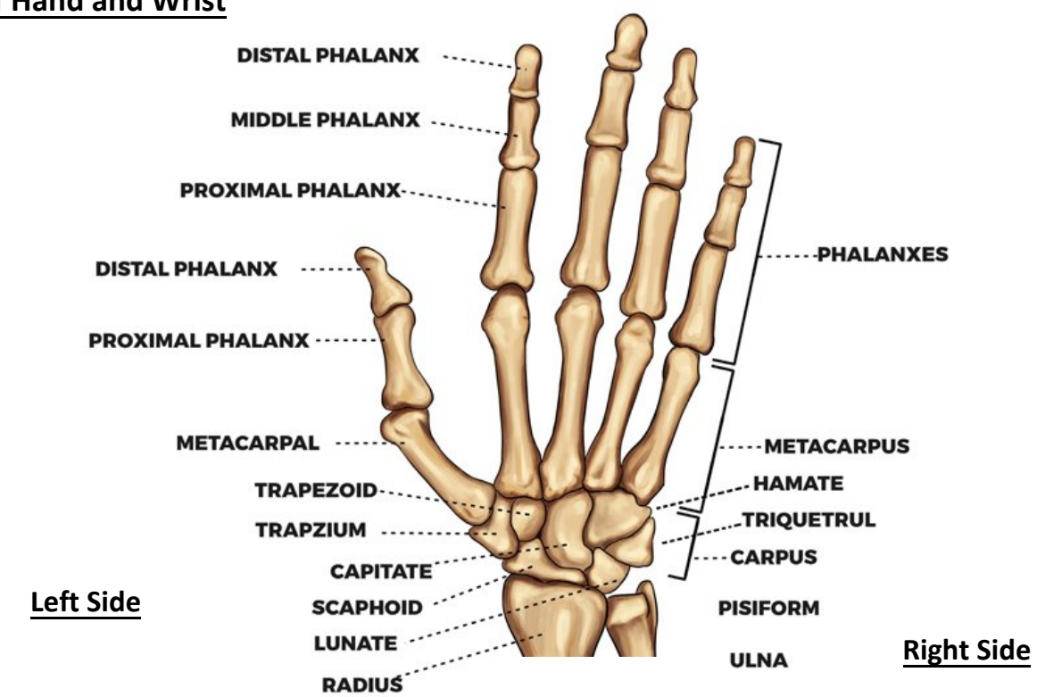
Diagram of Hand and Wrist